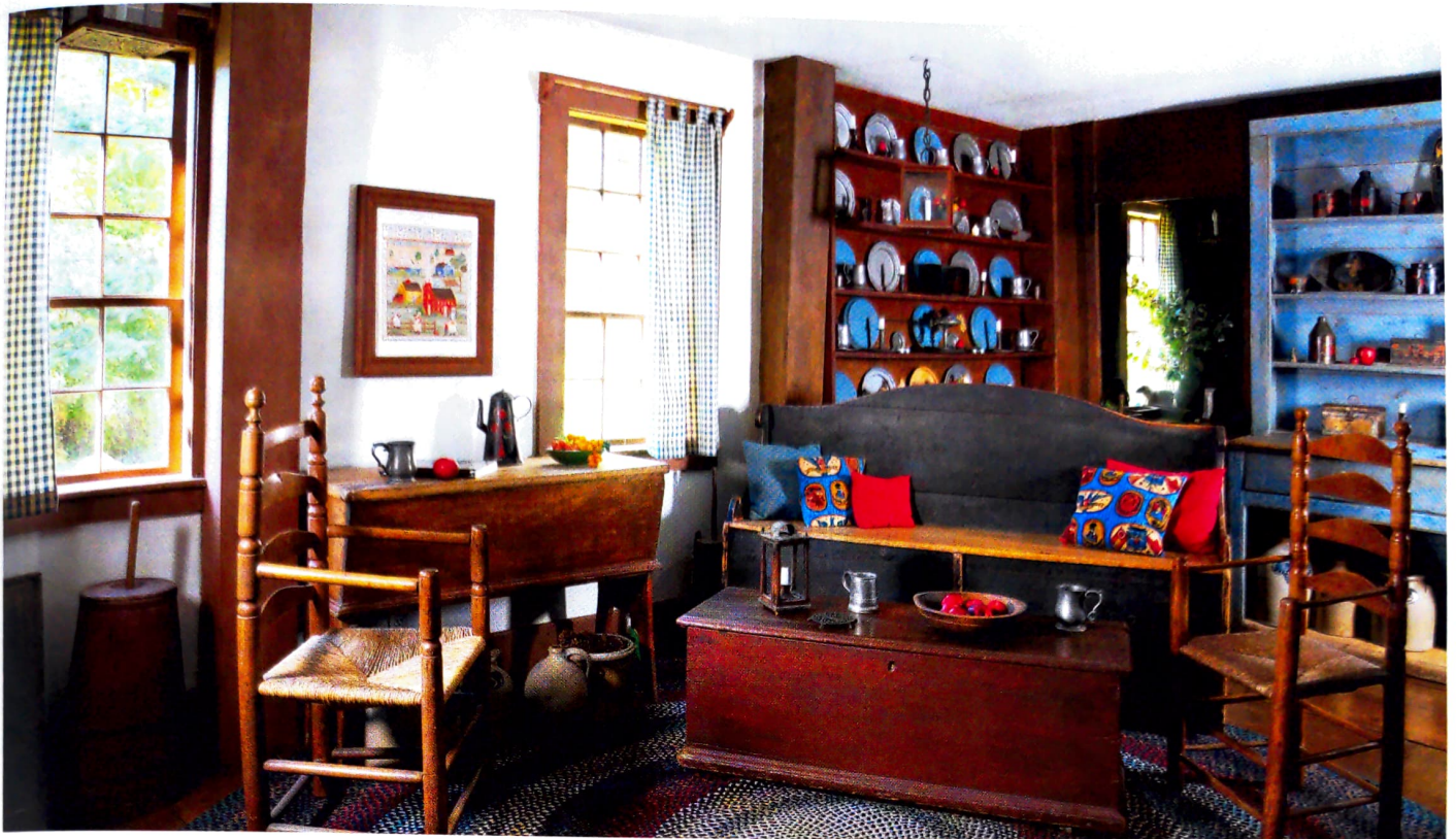
The Hovey's keeping room features such pieces as an 18th Century bench bed or "banc-lit," a "Great Chair" dated 1690 to 1710, a huge blue step-back cupboard that holds 19th Century painted tin and stoneware, and a six-board chest with long strap hinges. (Continued on page 94)