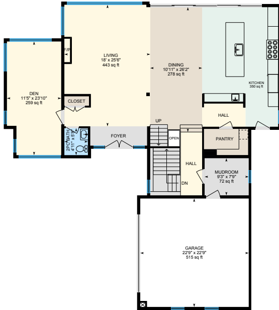
Main Floor Exterior Area 1911.15 sq ft

Main Building: Total Exterior Area Above Grade 4087.12 sq ft