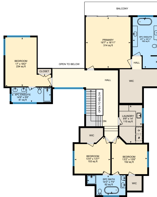
2nd Floor Exterior Area 2175.97 sq ft