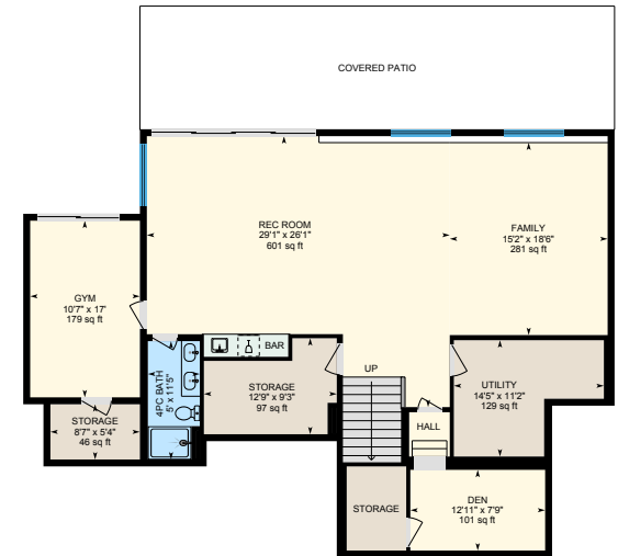
Basement (Below Grade) Exterior Area 1834.40 sq ft