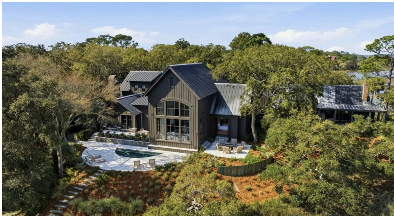
Leslie Turner represents this $12.9 million estate on Kiawah Island in South Carolina.

Properties for sale in the immediate ZIP code: 81