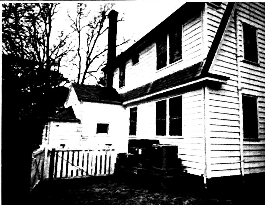
Photo Three Caption RIGHT SIDE VIEW - DATE OF PHOTO 02/01/2019

If submitting more photographs than will fit on the preceding page, affix the additional photographs below. Identify all photographs with date taken, "Front View" and "Rear View", and if required, "Right Side View" and "Left Side View". When applicable, photographs must show the foundation with representative examples of the flood openings or vents, as indicated in Section A8.