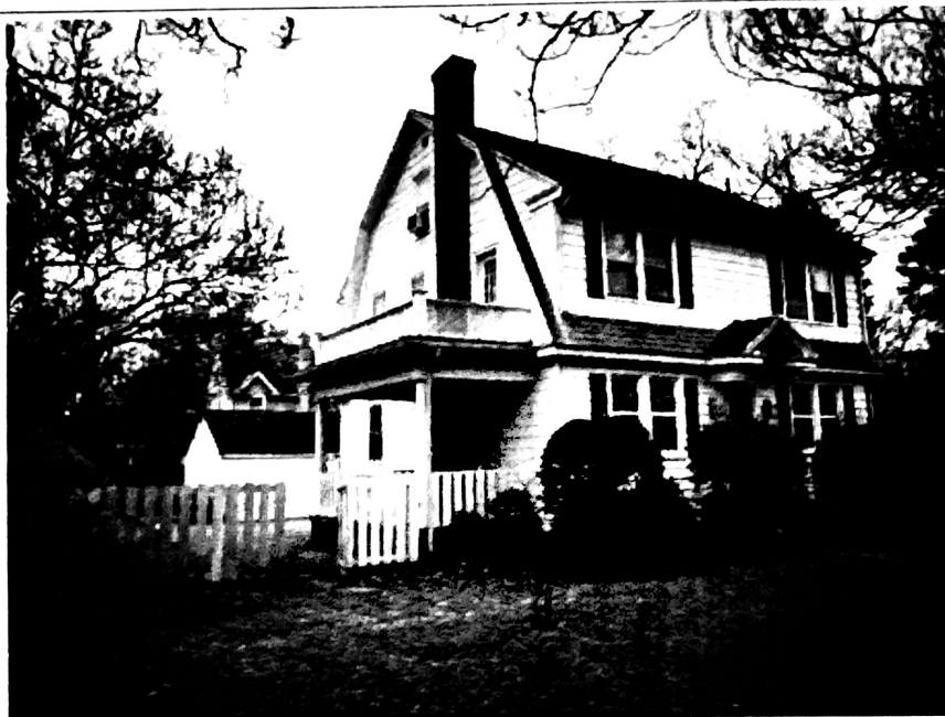
Photo One Caption FRONT AND RIGHT SIDE VIEW - DATE OF PHOTO 02/01/2019

If using the Elevation Certificate to obtain NFIP flood insurance, affix at least 2 building photographs below according to the instructions for Item A6. Identify all photographs with date taken, "Front View" and "Rear View", and, if required, "Right Side View" and "Left Side View". When applicable, photographs must show the foundation with representative examples of the flood openings or vents, as indicated in Section A8. If submitting more photographs than will fit on this page, use the Continuation Page.