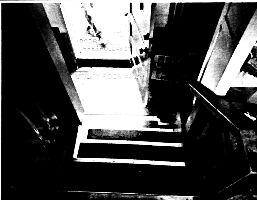
Photo Four Caption UTILITY ROOM ENTRANCE - DATE OF PHOTO 02/01/2019