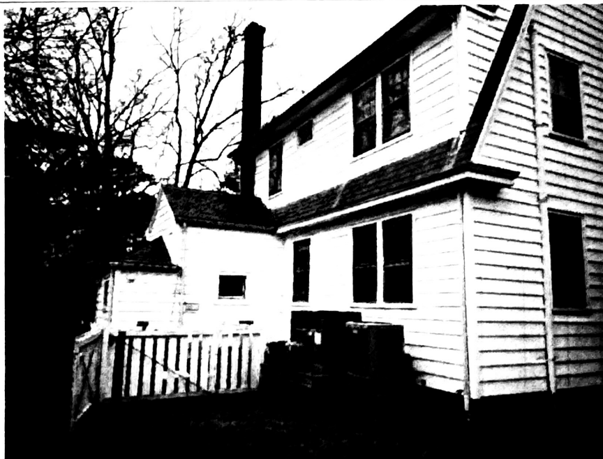
Photo Two Caption REAR VIEW AND HVAC - DATE OF PHOTO 02/01/2019