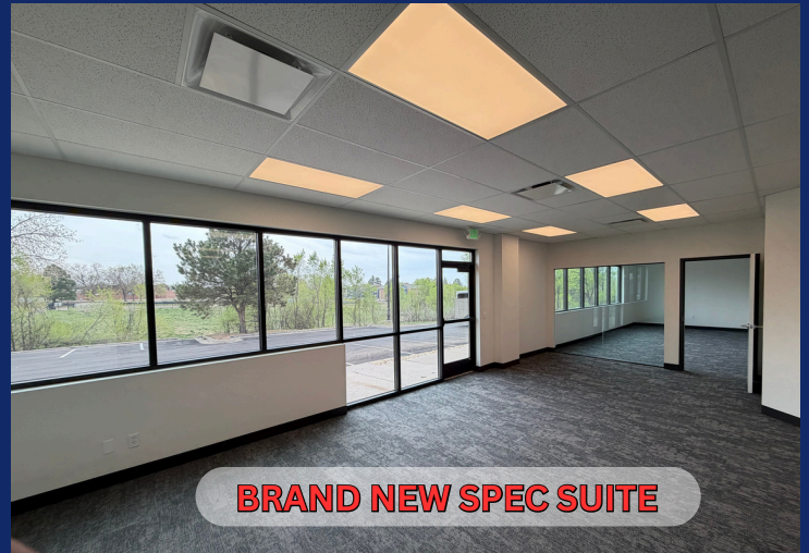
BRAND NEW SPEC SUITE