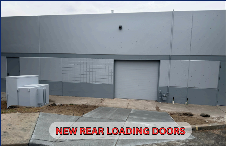
NEW REAR LOADING DOORS