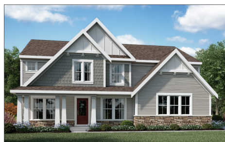
COASTAL CLASSIC (WITH OPTIONAL STONE VENEER & OPTIONAL SIDE ENTRY GARAGE)