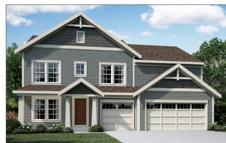
WESTERN CRAFTSMAN (WITH OPTIONAL THREE-CAR INTEGRATED FRONT ENTRY GARAGE)