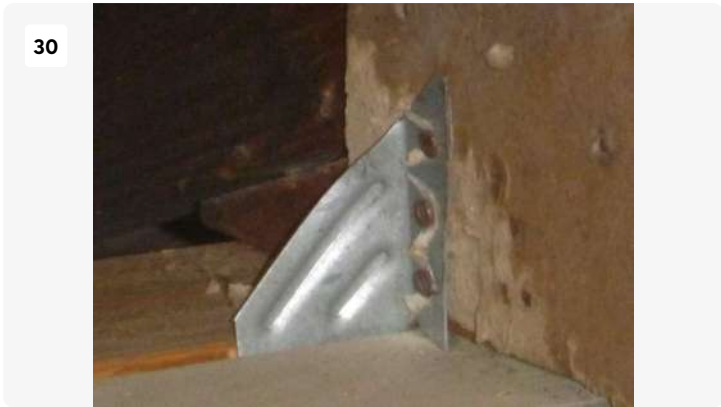
Date: Feb 19, 2026, 12:46 PM