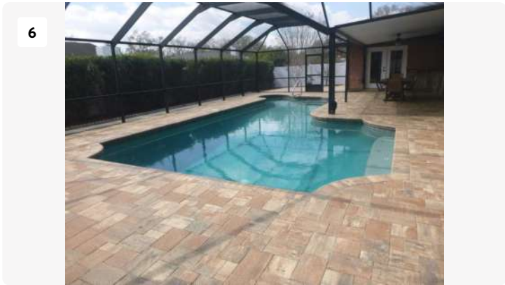
Date: Feb 19, 2026, 12:05 PM