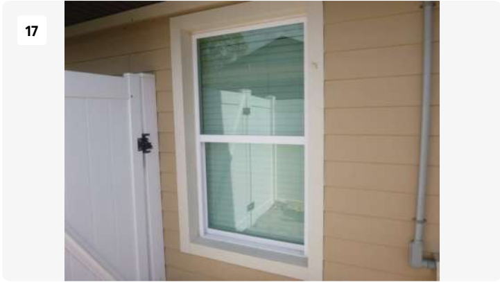
Date: Feb 19, 2026, 12:22 PM