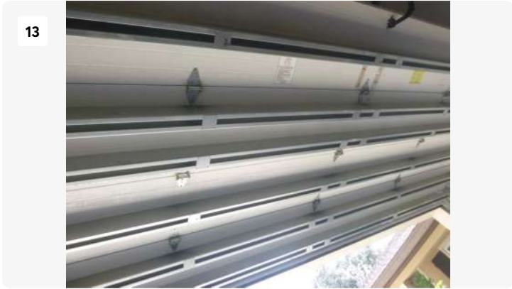
Date: Feb 19, 2026, 12:21 PM