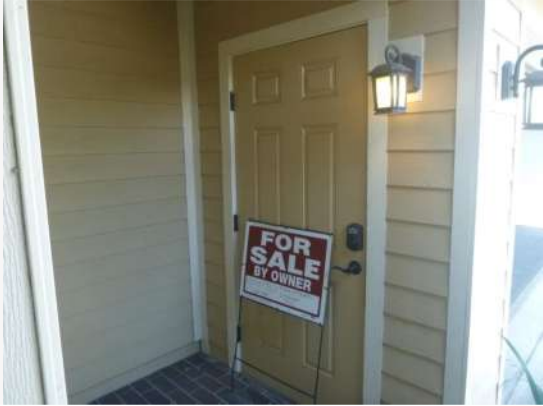
Date: Feb 19, 2026, 12:23 PM