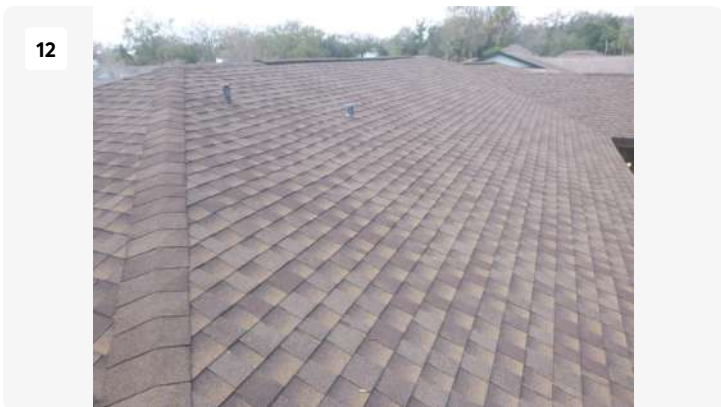
Date: Feb 19, 2026, 12:08 PM