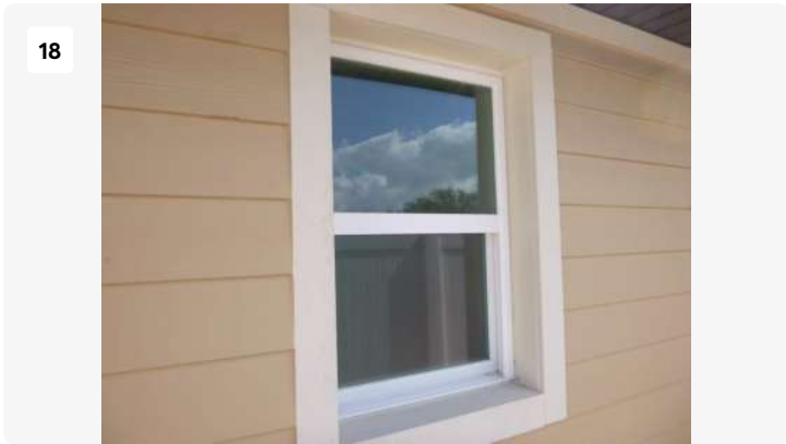
Date: Feb 19, 2026, 12:22 PM