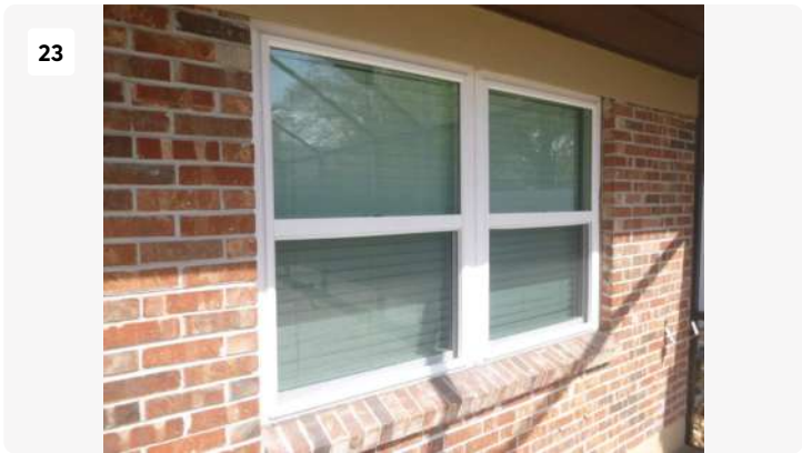
Date: Feb 19, 2026, 12:22 PM