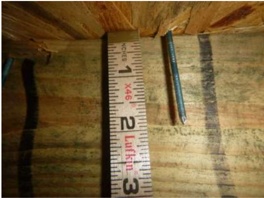
Date: Feb 19, 2026, 12:33 PM