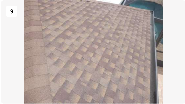
Date: Feb 19, 2026, 12:07 PM