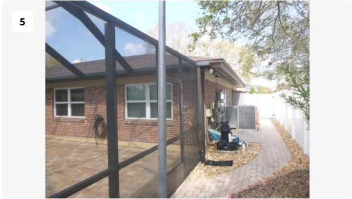
Date: Feb 19, 2026, 12:05 PM