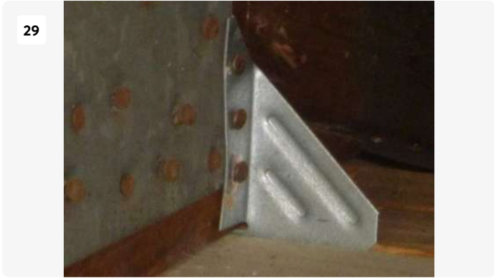
Date: Feb 19, 2026, 12:46 PM