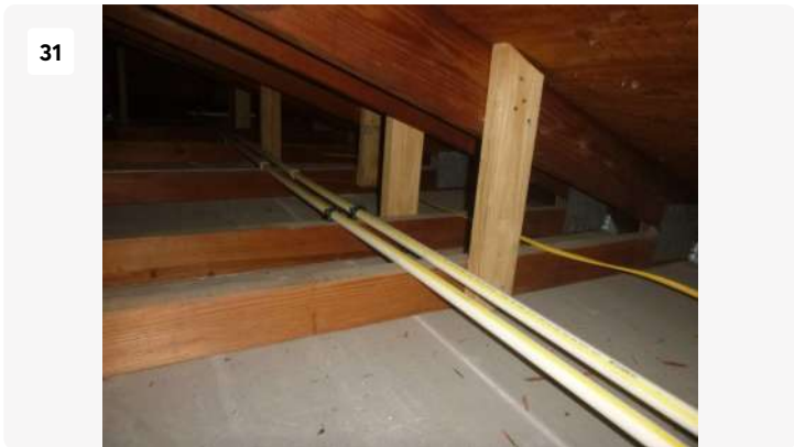
Date: Feb 19, 2026, 12:47 PM