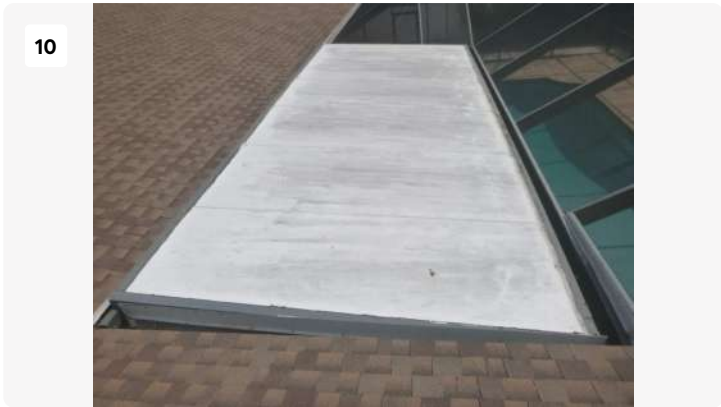
Date: Feb 19, 2026, 12:07 PM