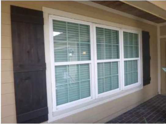
Date: Feb 19, 2026, 12:23 PM