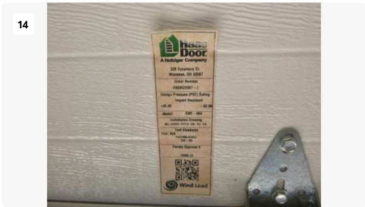
Date: Feb 19, 2026, 12:21 PM