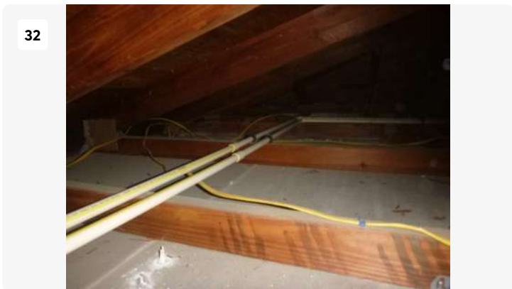
Date: Feb 19, 2026, 12:47 PM