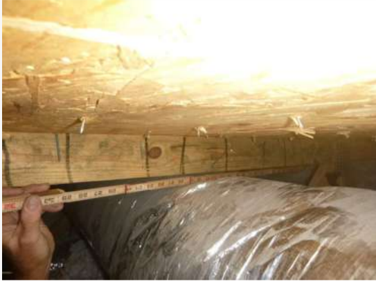
Date: Feb 19, 2026, 12:33 PM