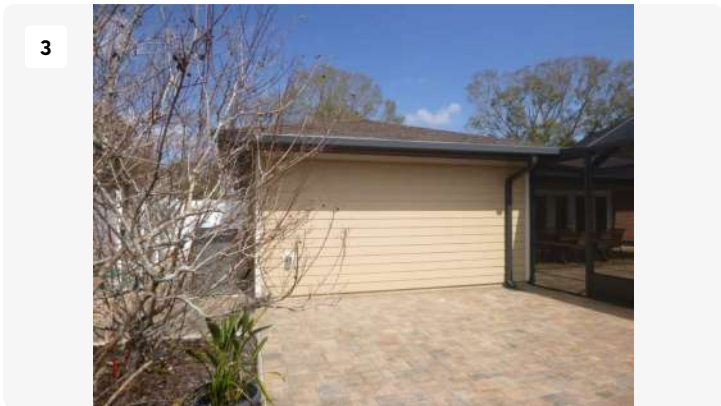
Date: Feb 19, 2026, 12:04 PM