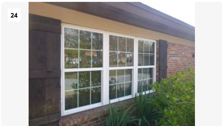
Date: Feb 19, 2026, 12:23 PM