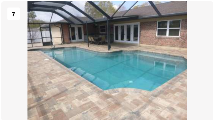
Date: Feb 19, 2026, 12:05 PM