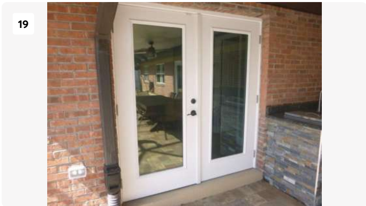
Date: Feb 19, 2026, 12:22 PM