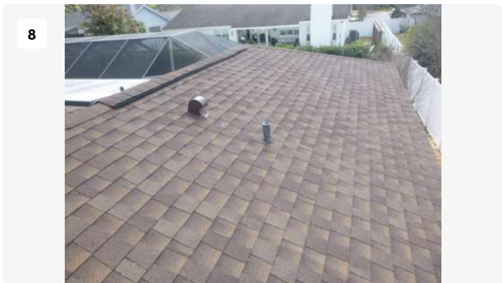
Date: Feb 19, 2026, 12:07 PM