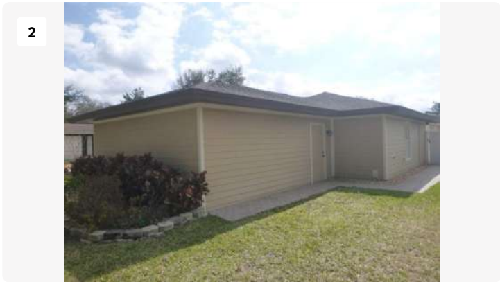
Date: Feb 19, 2026, 12:04 PM