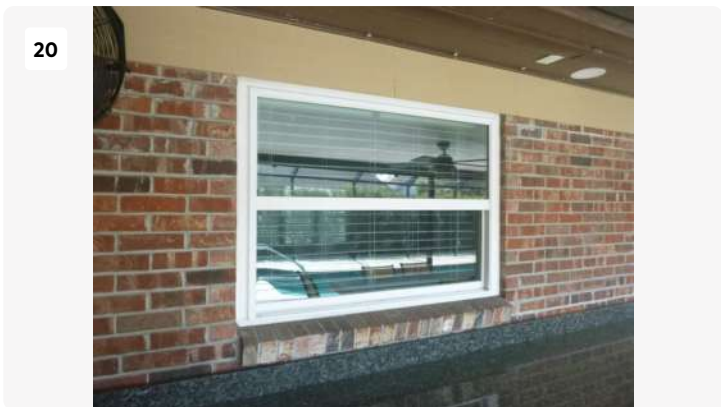
Date: Feb 19, 2026, 12:22 PM