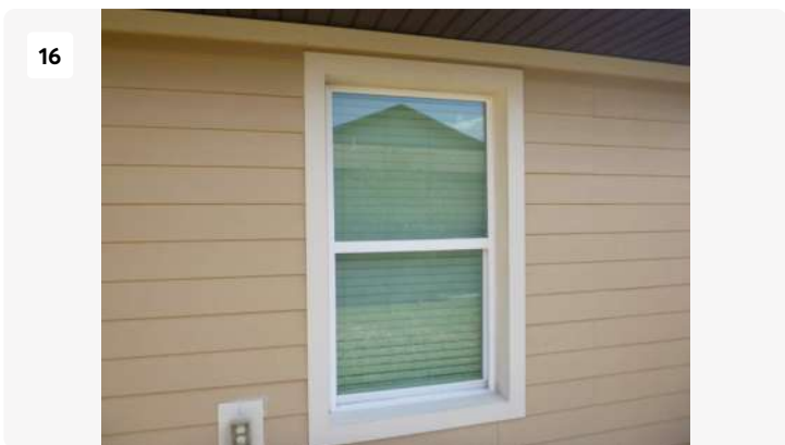
Date: Feb 19, 2026, 12:21 PM