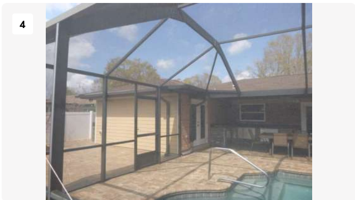
Date: Feb 19, 2026, 12:05 PM