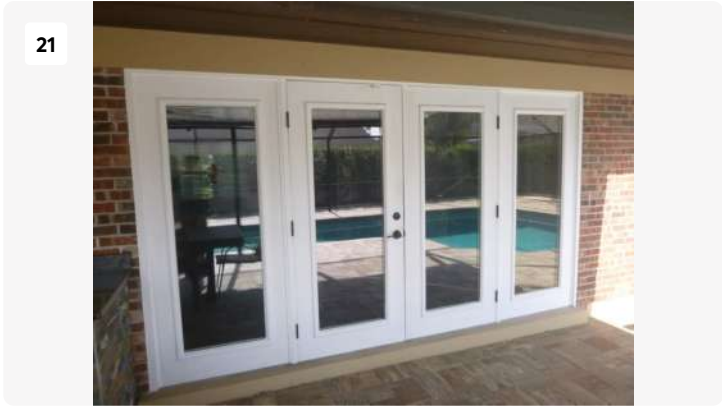
Date: Feb 19, 2026, 12:22 PM