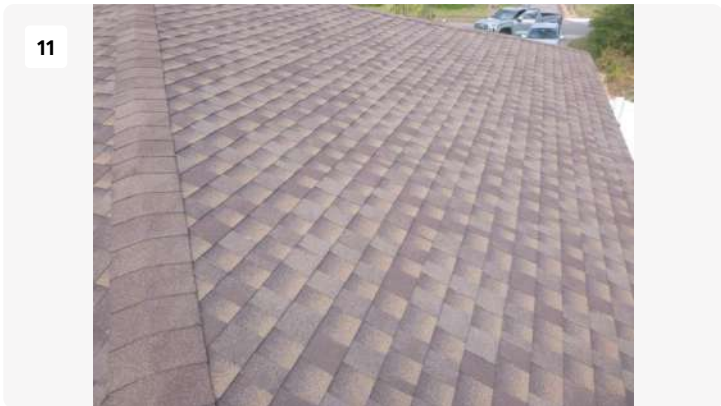
Date: Feb 19, 2026, 12:08 PM