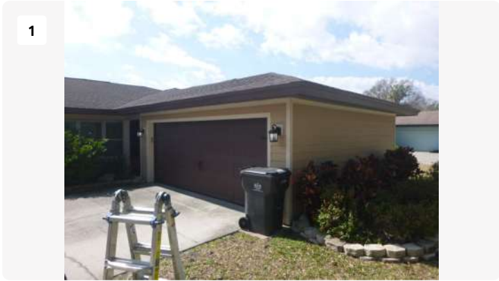
Date: Feb 19, 2026, 12:02 PM