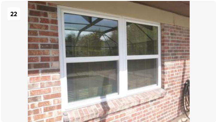
Date: Feb 19, 2026, 12:22 PM