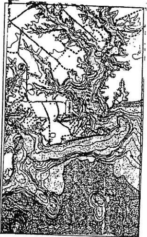
LOCATION MAP SCALE: 1" = 2000'