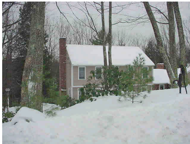
( https://images.vgsi.com/photos/BedfordNHPhotos/\00\00\43\16.jpg )