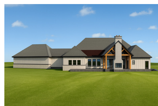
Proposed Back Elevation