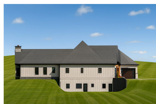
Proposed Walkout Elevation